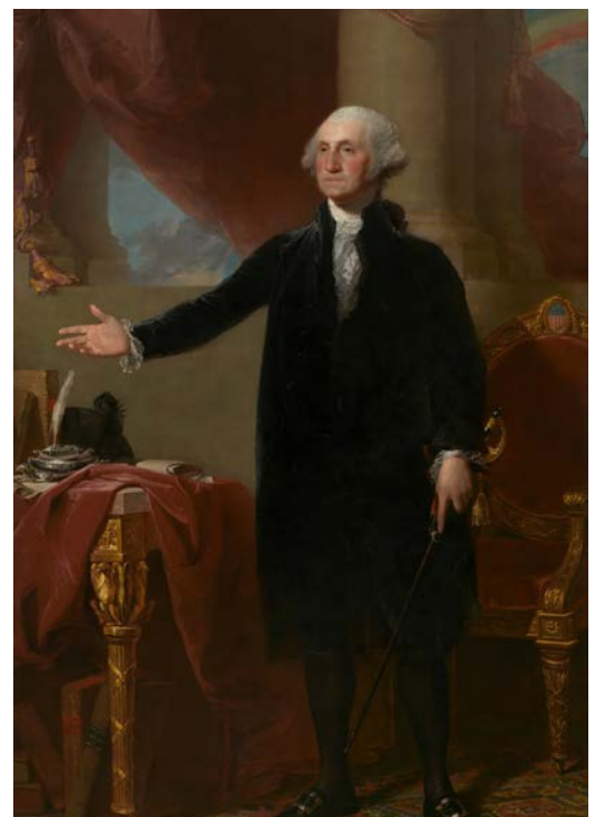
Photo courtesy of National Portrait Gallery, Smithsonian Institution, George Washington, https://npg.si.edu/object/npg_NPG.2001.13?destination=portraits

The right to participate in public life was limited to men of property. People were subjects, not citizens.