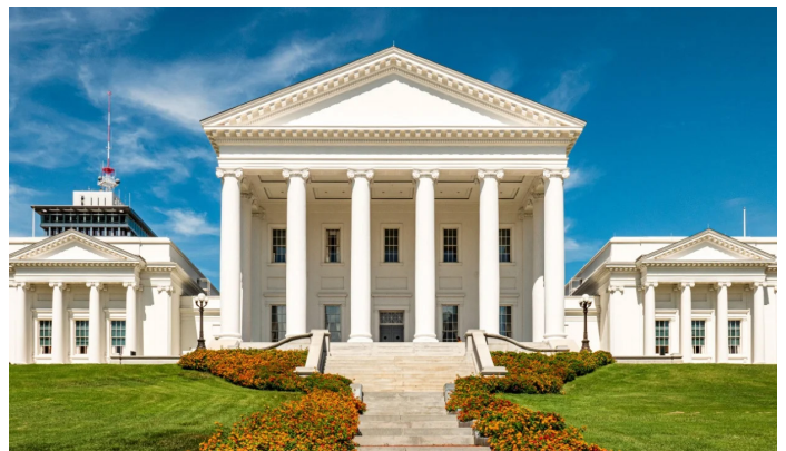
Commonwealth of Virginia State Capitol, Richmond VA