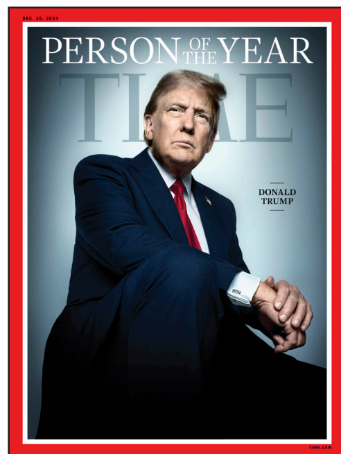
Time Magazine Cover December 12, 2024

Since he began running for President in 2015, perhaps no single individual has played a larger role in changing the course of politics and history than Trump. He shocked many by winning the White House in 2016, then led the U.S. through a chaotic term that included the first year of a pandemic as well as a