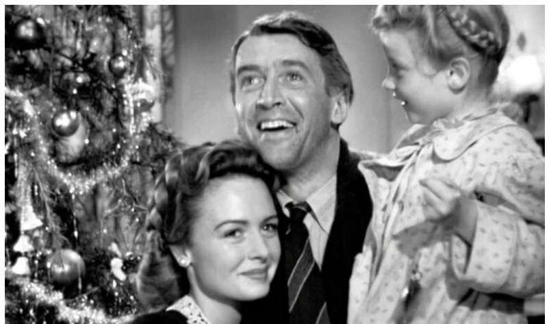
"It's a Wonderful Life", produced and directed by Frank Capra. Seen here from left, Donna Reed as Mary Hatch Bailey, James Stewart as George Bailey and Karolyn Grimes as Zuzu. Paramount Pictures.

Over the last century no movie has been more synonymous with the Christmas season than It's a Wonderful Life . A copyright lapse allowed this modestly successful movie to become a staple of holiday programming for generations. But it endures, more than seven decades after its release, because it strikes at least five deep spiritual chords in every human heart.